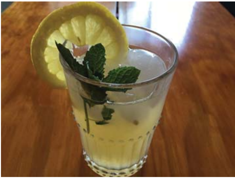
Ginger-Mint Green Lemonade